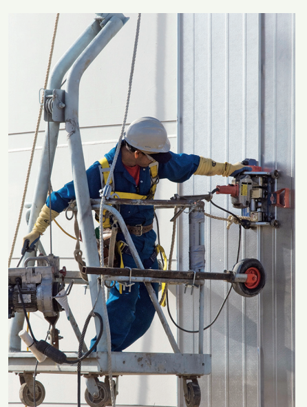
Panels are installed easily and quickly by using a hanging basket or cherry picker, eliminating scaffolding requirements.

Prefabricated standing seam insulation panels installation