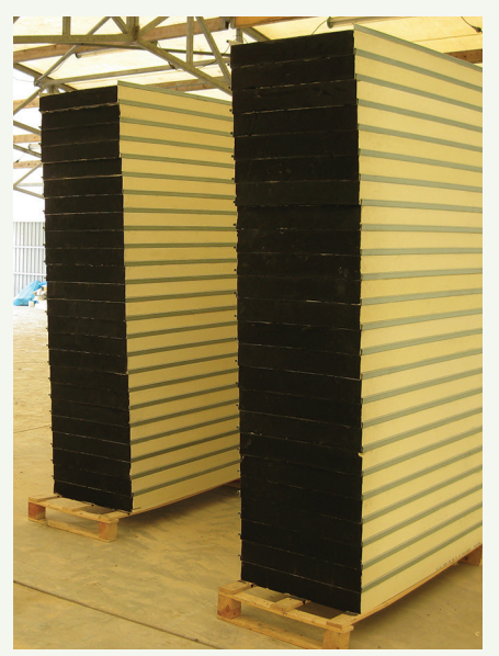
Prefabricated panels are stored in containers or a warehouse on site.

Certified cables are placed around the tank. Stainless steel clips fixed on this cable are captured within the seam made between two panels, resulting in a mechanically superior system with inherent expansion and contraction properties.