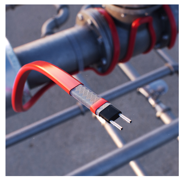
Self-regulating heating cable

Accurate control for adaptable tank storage Regardless of size or location, precise temperature control of chemical fluids during transport to and from loading sites is a foundational consideration. At their most basic level, in-feed line heat tracing systems must be able to maintain the optimum temperature for product quality and safety. However, to allow customers to shift their storage strategies in line