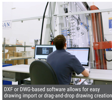
DXF or DWG-based software allows for easy drawing import or drag-and-drop drawing creation.

Once specifications are programmed, it can be saved as a template for future use – making repeat orders or modification of standard equipment even faster. Delays and waste are greatly reduced, and the risk