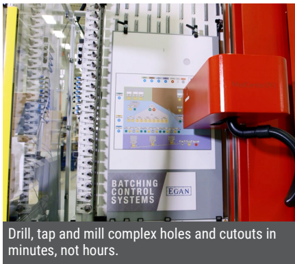
Drill, tap and mill complex holes and cutouts in minutes, not hours.

Precision, speed, and safety are the cornerstones of any successful panel builder. Whether for an in-house job or a customer, Egan's goal is to deliver a product quickly and correctly – the first time. And that's why Egan's panel shop implemented the ModCenter, an automated modification tool that provides fast, clean cut holes in each control panel.