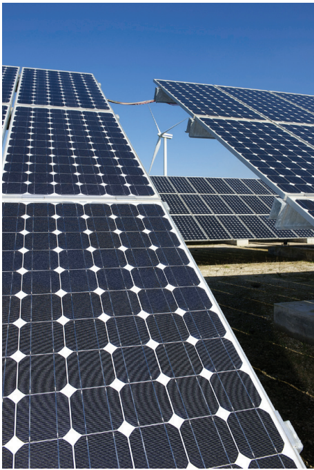
In order to ensure continued operation of critical electronic and networking equipment in solar applications, designers must select the ideal electrical enclosures that assist with solar thermal and tracking systems.

application will provide the intended protection and years of reliable service from the enclosure and equipment inside.