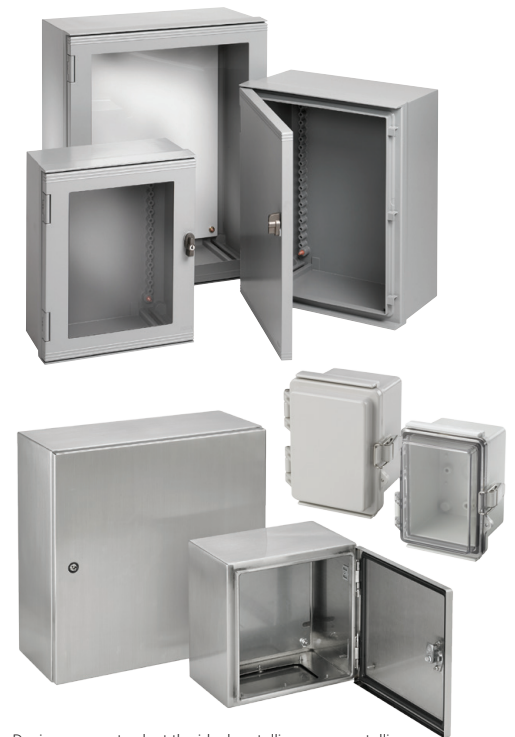
Designers must select the ideal metallic or non-metallic enclosure material for each individual solar application for the highest level of durability and longevity.

While solar power is an excellent source of energy, these applications are often located outdoors, exposing electrical enclosures, and the equipment within, to harsh environmental elements and demands. Whether for large, on-grid photovoltaics systems or concentrated solar power systems, designers want to implement electrical enclosure solutions that perform reliably, often under punishing conditions that exist in outdoor applications. These conditions can include UV radiation and temperature extremes, wind with blowing rain, snow, dust and dirt and salt spray in coastal regions.