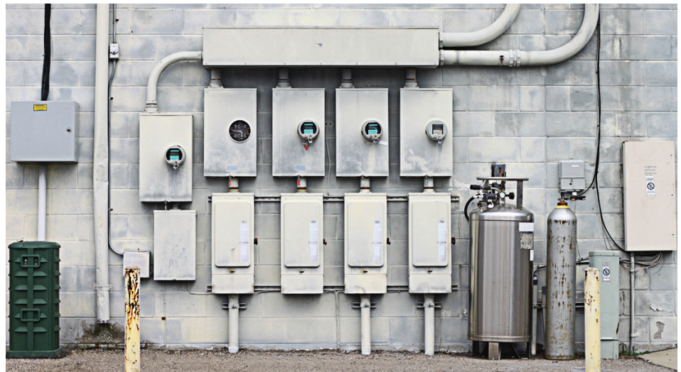
Enclosure solutions that perform reliably under punishing conditions existing in outdoor applications, such as UV radiation and temperature extremes, wind with blowing rain, snow, dust and dirt and salt spray in coastal regions.

The use of polyester, polycarbonate or hybrid polycarbonate/polyester blends for non-metallic enclosures provide new alternatives to fiberglass and stainless steel for corrosion resistance. These materials offer a wide range of performance characteristics and may prove to be a more cost-effective solution in some applications. Thermal plastic enclosures are molded by injecting the thermoplastic material into a mold, and the finished product is an attractive, uniform enclosure with a material that exhibits high impact resistance, electrical insulation