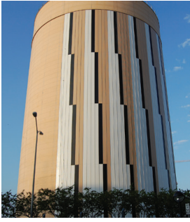
Customized colored panels create a unique appearance for the tank