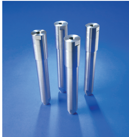
Small floor stands and leg footprints minimize floor contact, reducing potential entrapment areas for washdown solutions and contaminants.

Maintaining sanitary food and beverage processing environments while protecting the associated control systems from high-pressure washdown solutions remains an ongoing challenge. However, specifying an enclosure designed with features suitable for such applications—one that is high quality and correctly constructed, designed, hinged, sealed, mounted and latched—combined with staff washdown procedure training can help food and beverage producers overcome these challenges.