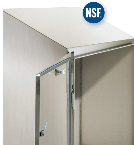
NSF/ANSI 169-certified enclosures will ensure product safety, equipment protection and a sanitary production environment.

To promote sanitary conditions and optimize product safety in the long run, only enclosures and equipment with the appropriate NSF certification should be installed. NSF, the world's leading not-for-profit consumer safety ratings agency, developed the NSF/ANSI 169 standard—which specifies the essential design criteria for food equipment and devices, including electrical enclosures. NSF/ANSI 169 certification, as it applies to electrical enclosures, assures that all hinges, mounting devices, latches and door surfaces will protect the critical equipment while resisting exposure to environmental elements and accumulation of dirt and debris. A few of the design and construction criteria that are required for NSF/ANSI 169 include: