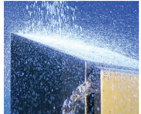
To maintain sanitary conditions, demanding food and beverage applications require high-pressure washdowns and harsh cleaning chemicals, which could damage electronic controls if they are not properly protected.

ONLY ENCLOSURES AND EQUIPMENT WITH THE APPROPRIATE NSF CERTIFICATION SHOULD BE INSTALLED