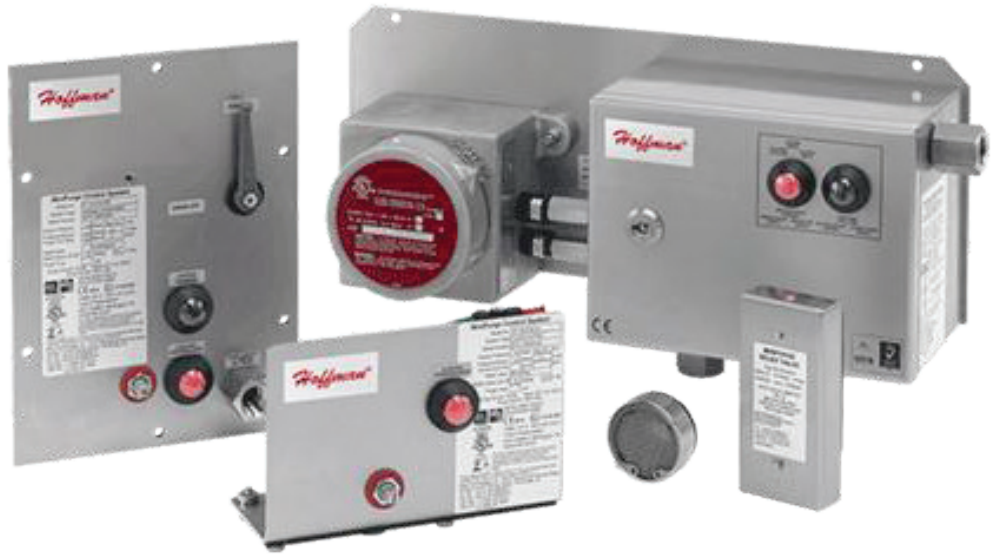
Purge and Pressurization Systems

Pressurization is the process of creating a higher internal pressure that is provided by a protective gas supply, preventing any hazardous gas or dust from entering the enclosure. Any penetrations or leak areas will have protective gas exiting the enclosure rather than hazardous gas or dust migrating into it. This segregates any external explosive or hazardous material from the energized internal equipment. NFPA requires a minimum pressure of 0.1 inches of water column (25Pa) for Class I and II applications