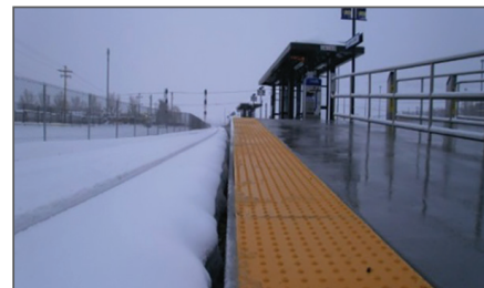
Platform Snow Melting and De-Icing