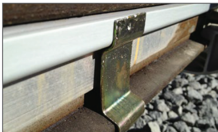
Contact Rail Heating