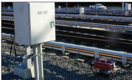
Switch Point Heating