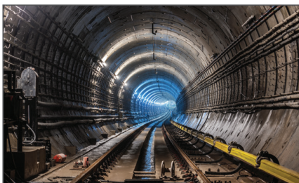
Fire and Performance Wiring