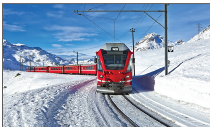
Rail Car Heating