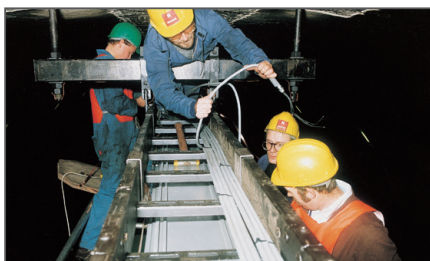
Engineering Design & Installation Services