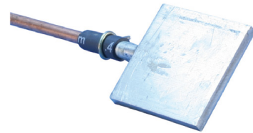
Assembly without Pigtail Figure 2