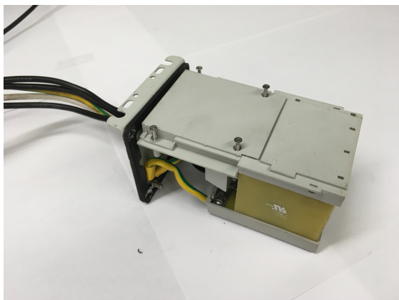
Step 2: Turn over, and remove the four screws holding the fuse cover in place. These screws are tight - use correct screwdriver size to avoid damaging screw head.