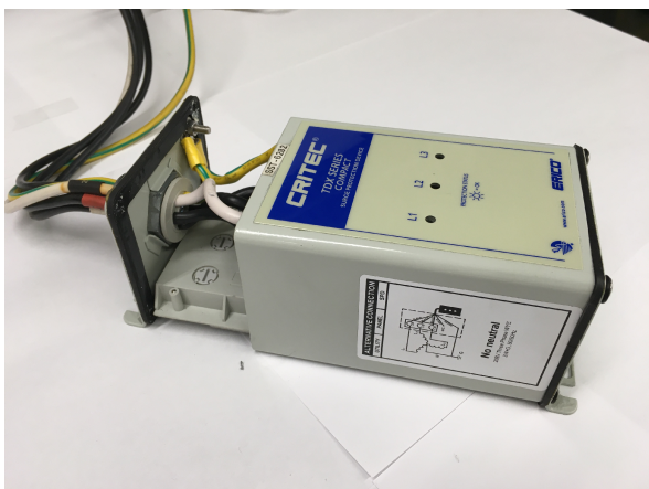
Step 1: Open the unit by removing the four screws located at the cable entry end of the product.