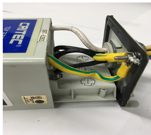
Step 3: Use a large flat blade screwdriver to turn the appropriate fuse ejector a quarter turn (90 degrees).